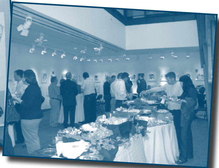
Kickoff Reception at the Ali Center