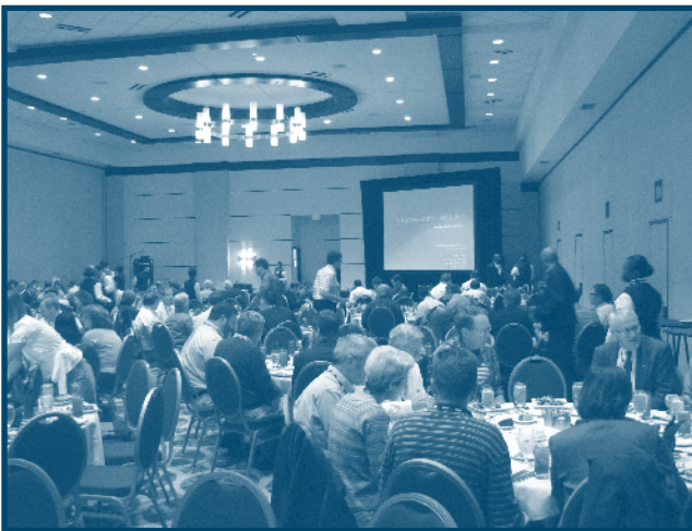
The Luncheon on Friday

The program was packed with current topics and strong speakers. Every session, including the seven mobile workshops were registered for CM credits – a valuable commodity for all AICP planners. The exhibit hall was a perfect place to congregate and snack between sessions while learning about the multitude of vendors there are in the region offering planning related products and services.